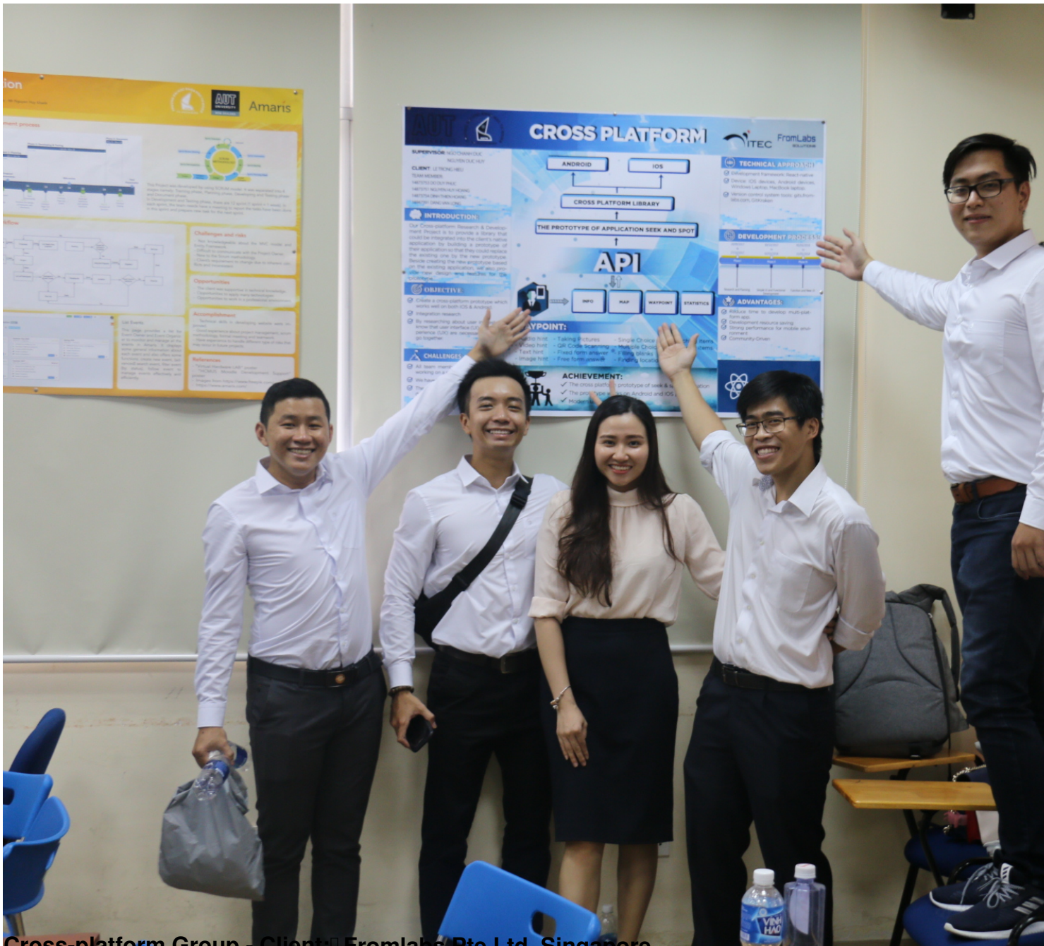
Cross-platform Group - Client: Fromlabs Pte.Ltd, Singapore

Tuesday, 05 June 2018 00:00 - Last Updated Tuesday, 23 October 2018 11:02