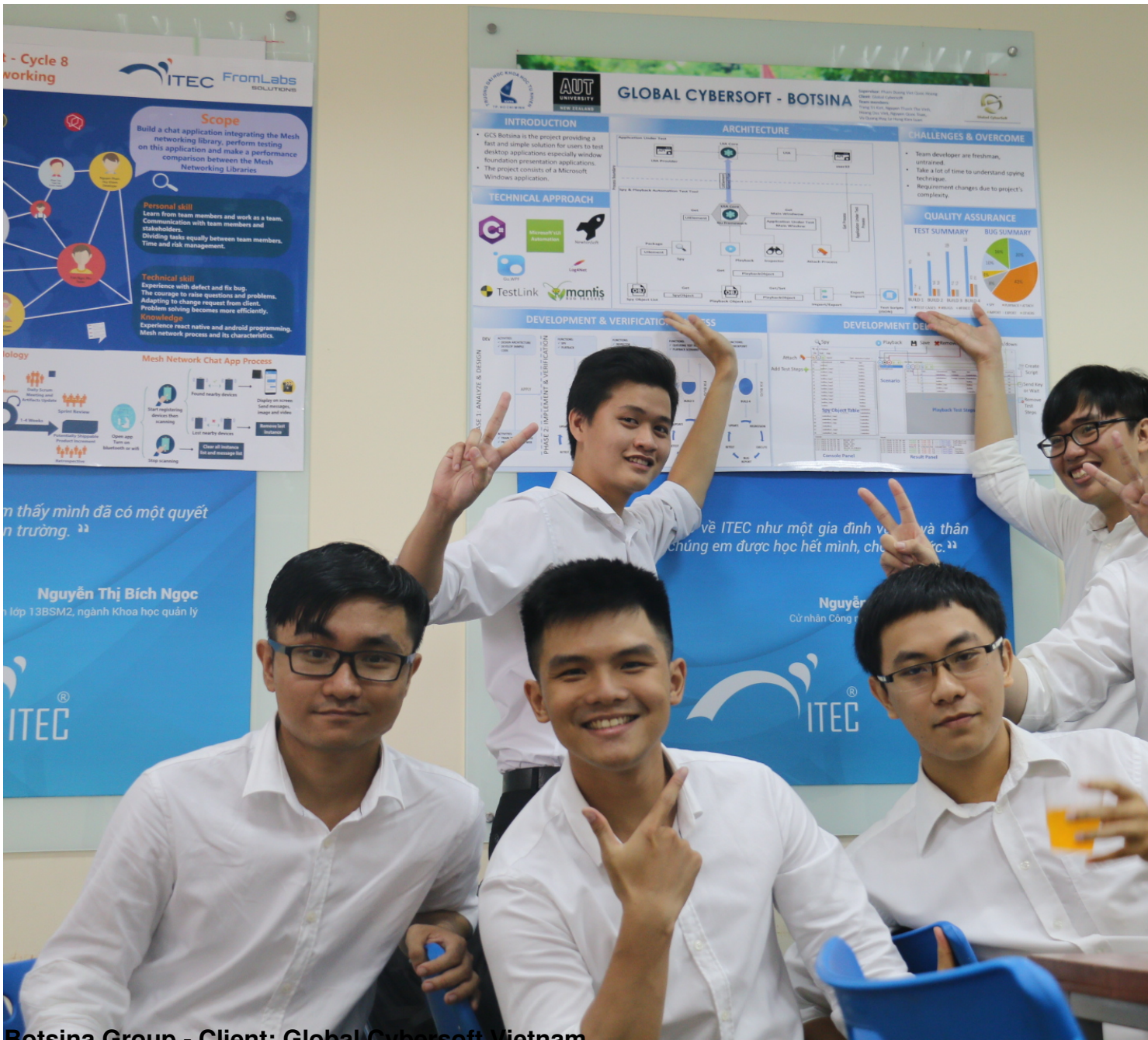
Botsina Group - Client: Global Cybersoft Vietnam

Tuesday, 05 June 2018 00:00 - Last Updated Tuesday, 23 October 2018 11:02