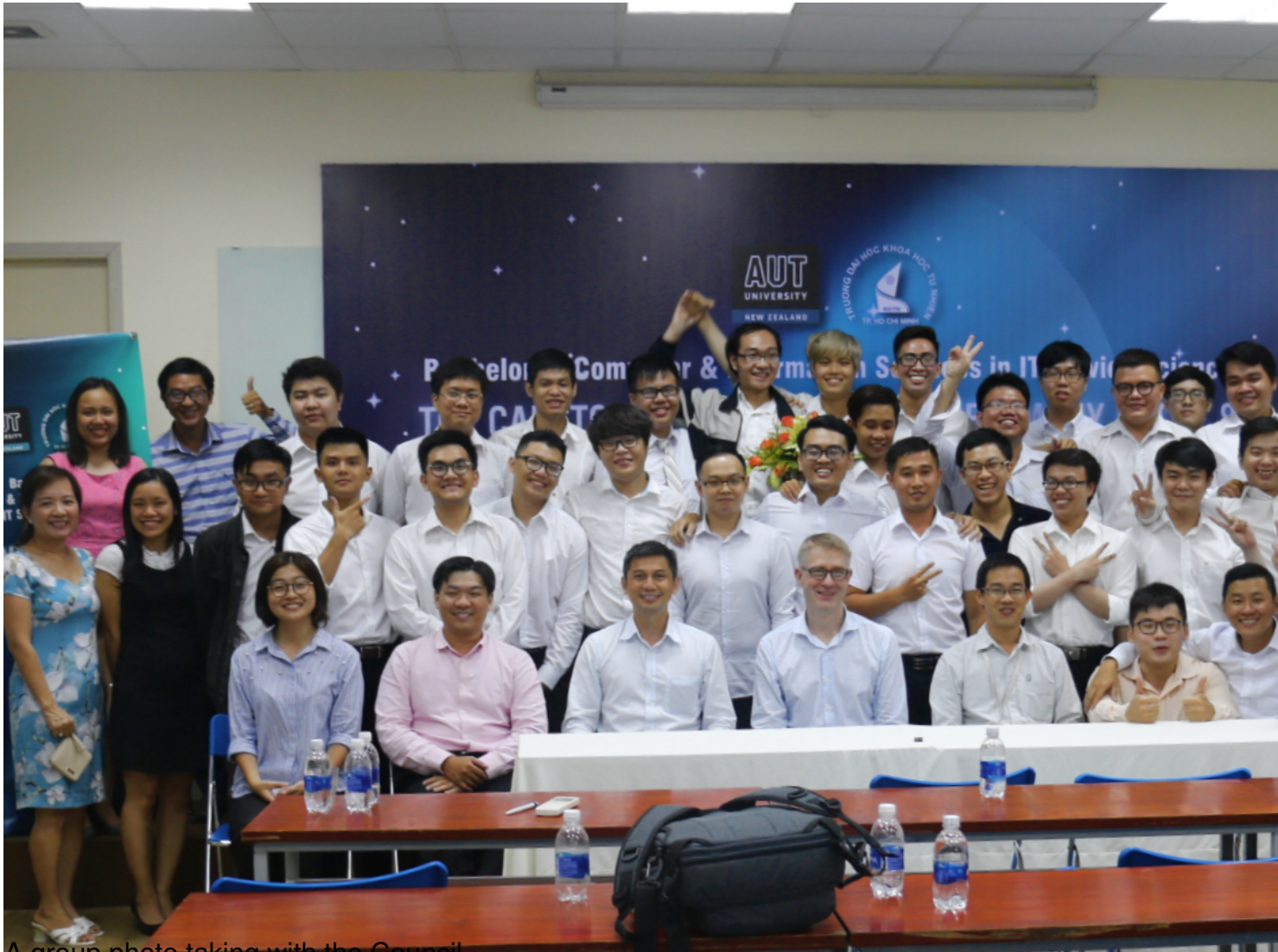
A group photo taking with the Council

Tuesday, 05 June 2018 00:00 - Last Updated Tuesday, 23 October 2018 11:02